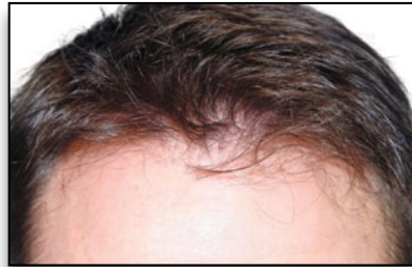
Hairline 9 months later