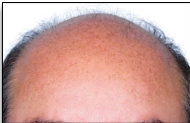
Hairline before the procedure