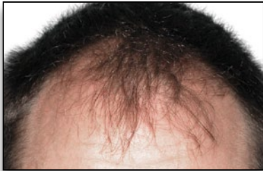
Hairline before the procedure

Hair growth typically begins around the 3 rd month after your procedure. The majority of hair growth usually occurs between 5 and 8 months following your procedure, with the remainder of growth between 8 and 10 months. This is a guideline regarding hair growth following your procedure. There are some patients who experience all of their growth early and some patients experience growth up to 1 year or more post-procedurally.