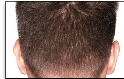
Donor area - Before procedure