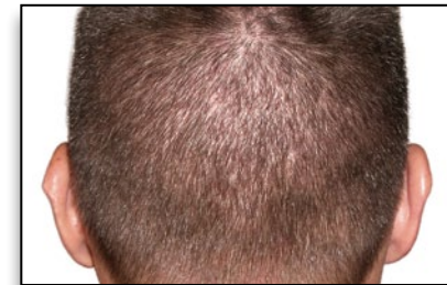
Donor area - 1 week later