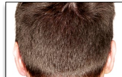
Donor area - 9 months later