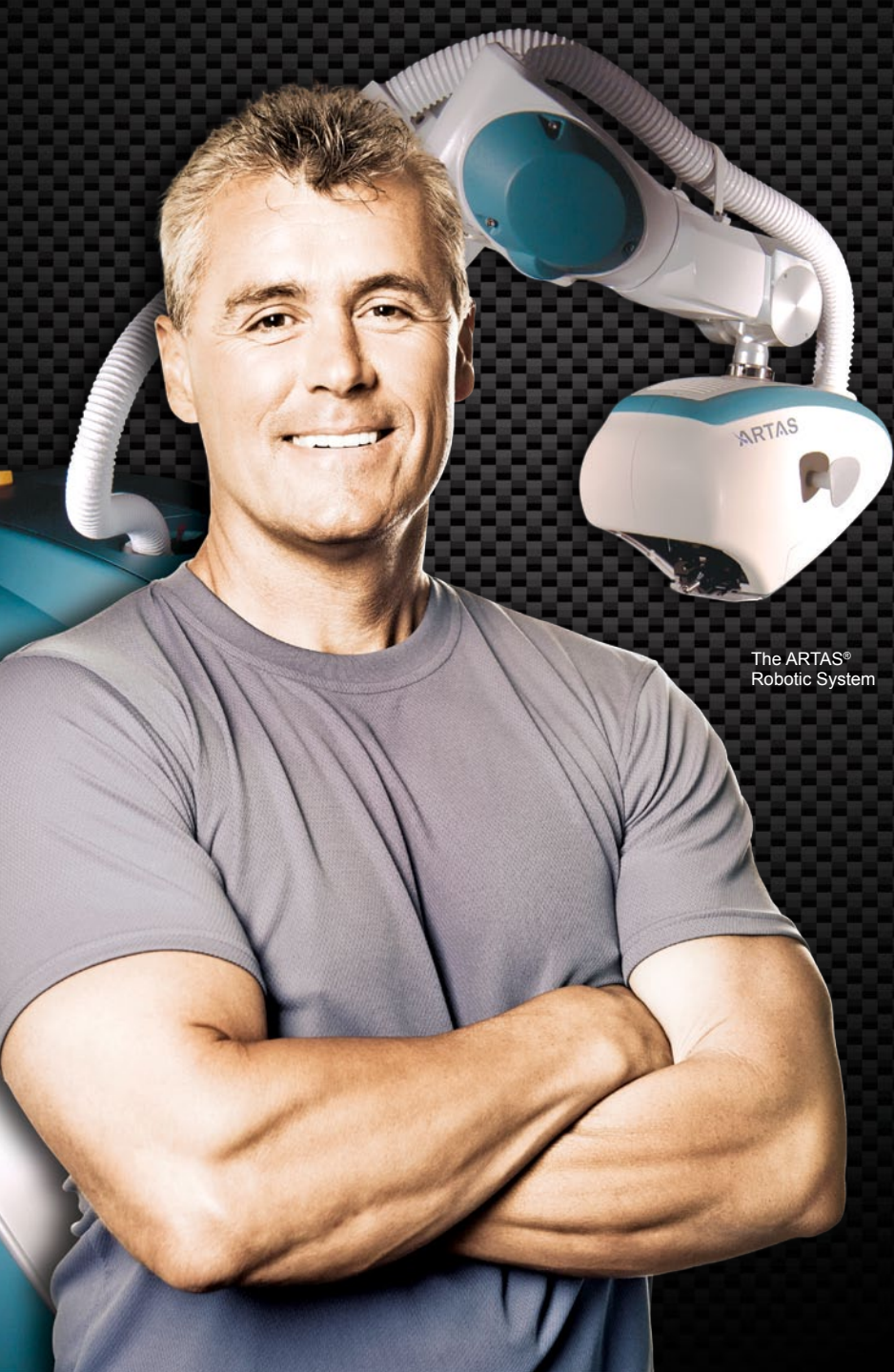
The ARTAS® Robotic System