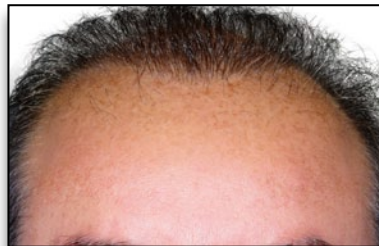
Hairline 12 months later

Precision robotics and your physician's expertise deliver safe, consistent, natural-looking results you can enjoy for a lifetime.